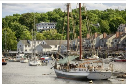
The top-drawer inn overlooks the Maine coast.

Dutch couple Raymond Brunyanszki and Oscar Verest have created a sumptuous guest